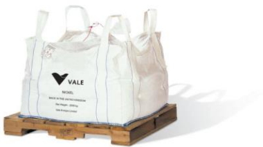
2 tonne bag

Disclaimer: The product descriptions and specifications contained in this document are made in accordance with our analyses and the methods used to produce Vale's nickel products. While these descriptions and specifications are reflective of normal production lots, rather than each individual piece, such descriptions and specifications shall in no event be deemed or interpreted as any representation, warranty or commitment by Vale in connection with Vale's nickel products quality. Vale's nickel products quality shall be determined only in accordance with the corresponding contract terms for each transaction agreed between Vale and Vale's customer and the quality related certificate issued under such contract.