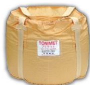
1 or 2 tonne bag

Disclaimer: The product descriptions and specifications contained in this document are made in accordance with our analyses and the methods used to produce Vale's nickel products. While these descriptions and specifications are reflective of normal production lots, rather than each individual piece, such descriptions and specifications shall in no event be deemed or interpreted as any representation, warranty or commitment by Vale in connection with Vale's nickel products quality. Vale's nickel products quality shall be determined only in accordance with the corresponding contract terms for each transaction agreed between Vale and Vale's customer and the quality related certificate issued under such contract.